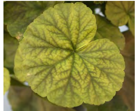
Figure 1. Chlorosis occurring on geranium leaves fertilized with plant extract fertilizers.

However, the liquid organic fertilizers developed foliar symptoms probably due to nutrient disorder. Leaves taken from plants fertilized with liquid Espartan and Bombardier plant extract fertilizers plants displayed a marked interveinal chlorosis (Figure 1), similar to magnesium deficiency in most plants, but the symptoms were not similar to those described in Geraniums IV (White, ed., 1993). Symptoms occurred on upper leaves rather than the lower leaves described in the reference. Since then I have observed similar symptoms on ‘Pink Carpet’ petunia (Figure 2) fertilized with plant extract fertilizers.