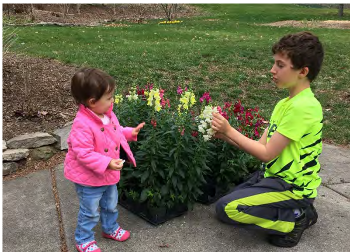
Figure 4. Snapdragons are great plants for kids. Promote the benefits of gardening as a family.