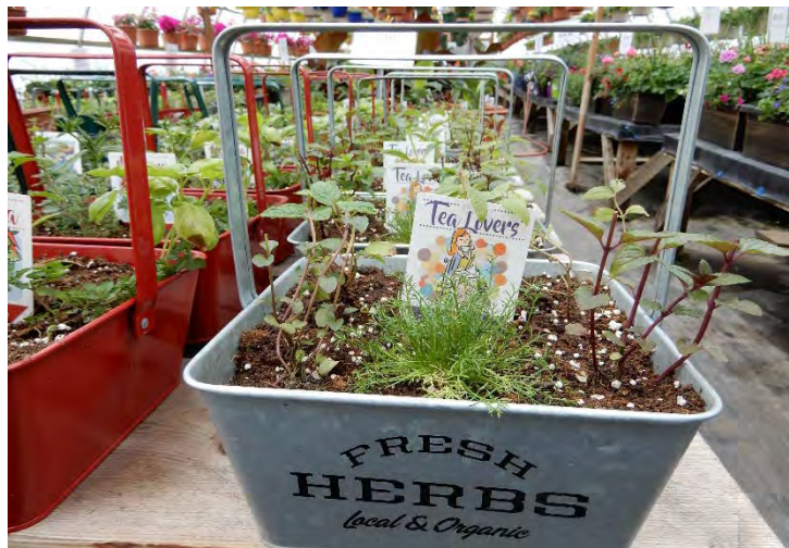
Figure 5. Create combinations of flowers, herb and vegetables for consumers eager to grow their own food.